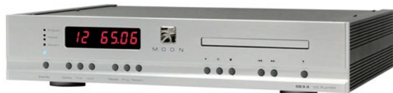
Moon Integrated Amplifier 3.3

Moon amplifiers offer a ten-year warranty. The combination provides an incredibly high degree of detail, musicality and power that makes you just want to sit down for a minute, "and just listen!"