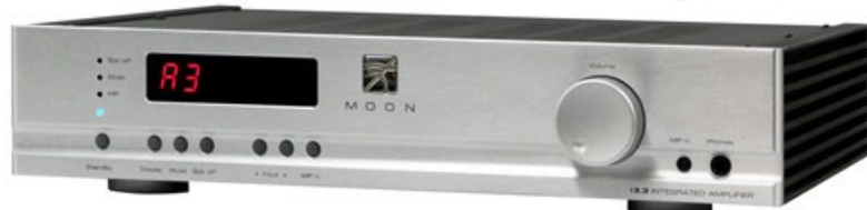
Moon CD Player 3.3